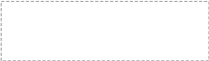
7" x 2" (Screen)