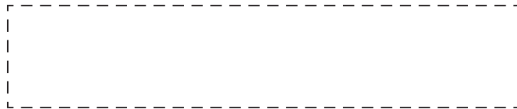
7-1/2" x 1-1/2" Wrap with Gap (SCREEN or DIGITAL)