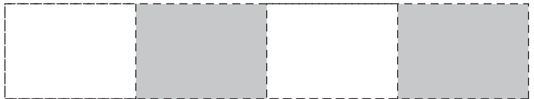
2-Sided Wrap (DIGITAL or LASER ENGRAVE)