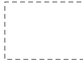
2-3/4" x 2" (DIGITAL or LASER ENGRAVE)