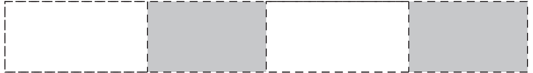
2-Sided Wrap (SCREEN) One Color Only